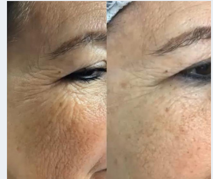
Before and after images of Filmed NCTF on the under eye and crows feet area.